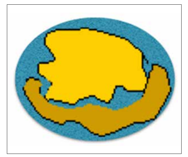
Figure 2. Union of individuals on the physical level with no harmony in any other way.

unfulfilled parents. This cell will find itself in a state of emotional diminution or suppression. The greater the parents' mental and emotional differences, the more their union will be disrupted, and when sufficiently great, it is possible to bring to life a child with a split personality who possesses two equally powerful points of view, as in schizophrenia.